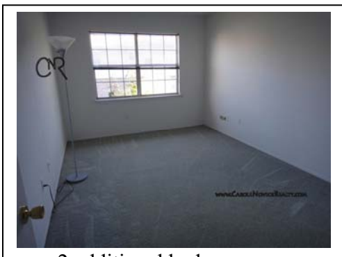
2 additional bedrooms are separated by hallway.