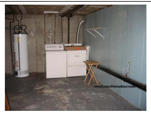
Laundry, storage area plus walk-in cedar closet

View all listings at our web site C NOVICK FOR ALL YOUR REAL ESTATE NEEDS! Offering Real Estate since 1971 Information deemed reliable but not guaranteed