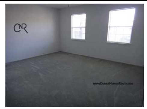
Master Bedroom has walk-in closet Plus second closet & on-suite bath.